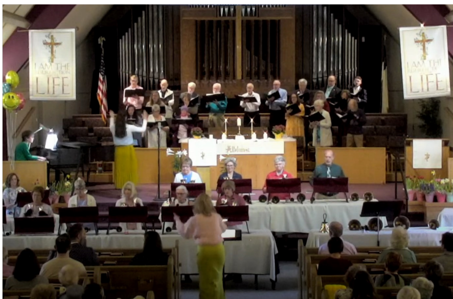
The combined bell and chancel choirs for Easter morning worship...what a glorious sound!